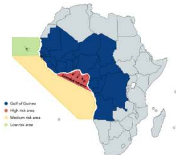
The map shows high-low risk areas of illegal and criminal activities in the Gulf of Guinea region

Another threat of climate change to security in coastal areas is the patterns of migration and displacement across the region. Towns along the coast remain the most developed and therefore a steady destination for migrants, especially young people. 43 This pattern of migration to cities is expected to continue due to the rise in urbanization. 44 Many of the region's main cities along the coastline like Lagos, Abidjan, Dakar and Accra are experiencing rapid growth. Ongoing projections indicate that 70 to 94 million people will inhabit West Africa's low-lying cities by 2050. 45 This will increase competition for