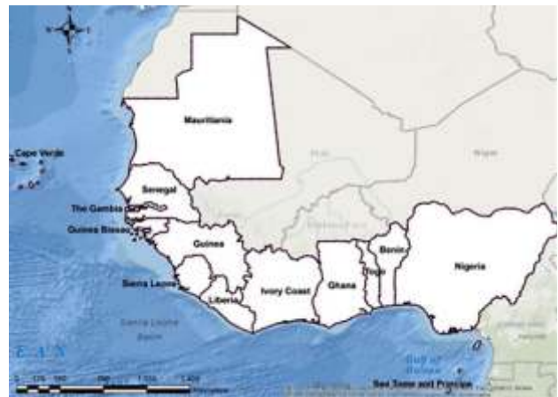
• A map of West Africa showing coastal countries

Climate change's impact on coastal areas does not only threaten coastal resources and human security, but also regional development and stability. Despite these threats, the impacts of climate change on coastal zones have not yet been adequately assessed and interrogated 4 . Regional climate change conversations appear to have focused primarily on security in the Sahel and the Lake Chad Basin, while attention to its effects on coastal communities has been relatively