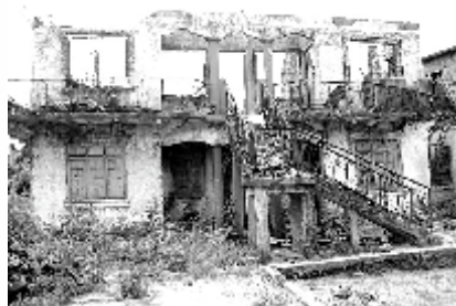
Another destroyed building, Tombia

Communities had often claimed that oil pollution had left the environment depleted, endangered and unable to sustain the regular daily subsistence agricultural practices of the communities. Unfortunately, the oil companies have been unable to extricate themselves from the blame of employing divide and-