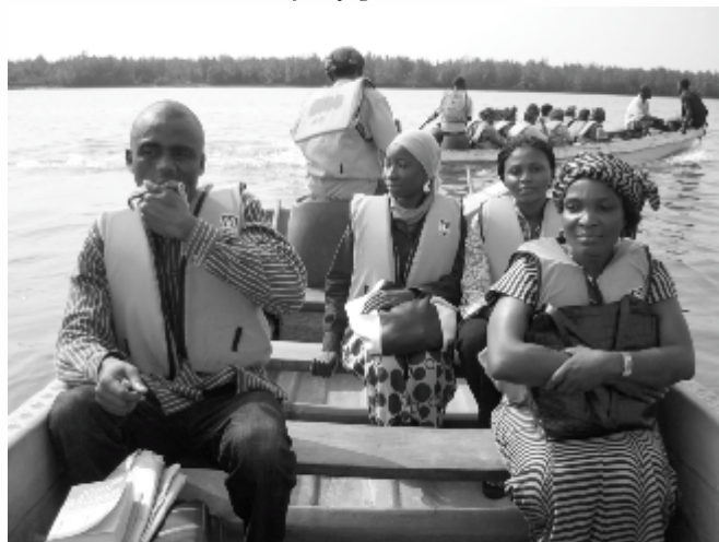
AAPW Needs Assessment Team on a boat ride to the creeks

of the technical skills. All the major towns and communities with commercial potentials to support, use or promote the development of technical skills were visited across the three senatorial districts in the three states