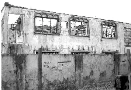
Burnt building, Tombia

their homes as they are afraid of going to their offices at the local government secretariat. Some are continuously on the run as they have been hunted by EFCC. Some have been impeached by their legislature for corruption and non performance. According to one observer, if only these armed youths will collaborate with their communities to demand for accountability from their local government authorities, elected representatives and other government officials and threaten them with kidnap, things would not have been the same in the Niger Delta.