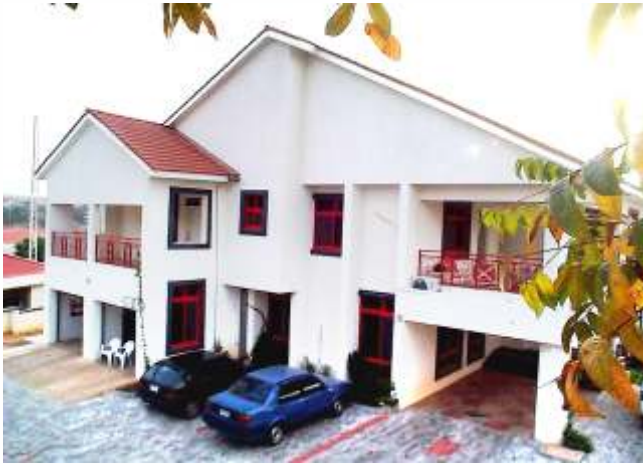
AAPW Head Office, Abuja.