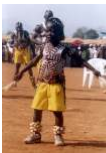
Young Jarawa dancer performing during the 2nd Karu Unity Festival

A festival is usually a series of performances of music, plays, etc., often connected to an activity or idea such as celebrating a special event. In the same light, Karu Unity Festival is a special event celebrating the cultural diversity of Karu local government area. Karu Local Government Area of Nasarawa State has been identified as "The Economic Growth Engine" of the state, and given its proximity to the FCT, has also been described as "one of the fastest growing urban areas in the world". With a growth rate of 40% per year, with thousands of immigrants flooding into the area from all parts of the country, Karu can best be described as a "Mini Nigeria". Therefore, a second unity festival was seen as a best way to consolidate on the gains of the peace and development activities in Karu, encourage partnering among various stakeholders as well as celebrate