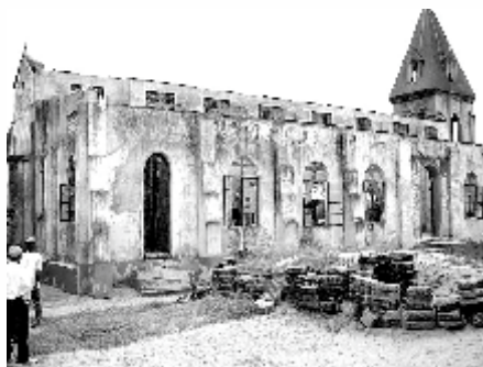
Destroyed Church building, Tombia

As mentioned in earlier edition of this newsletter, common problems of underdevelopment and intra and inter communal violent conflicts are more peculiar to the Niger Delta communities than anywhere else in Nigeria. Here, you find a growing concern over the last five years of crisis worsened by cult and cult related violence which has spilled over whole communities. Most youths in these areas have made their communities vulnerable to violence at the least disagreement or provocation. Very often, land and chieftaincy disputes or struggles for political offices has left most communities devastated and in near irreparable ruin. Tombia is a good example. It is widely believed that these youths