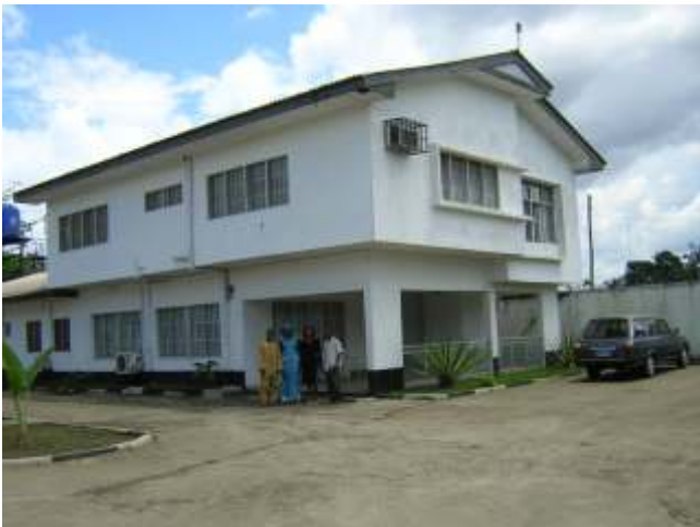
New AAPW Office, Port Harcourt, Rivers State