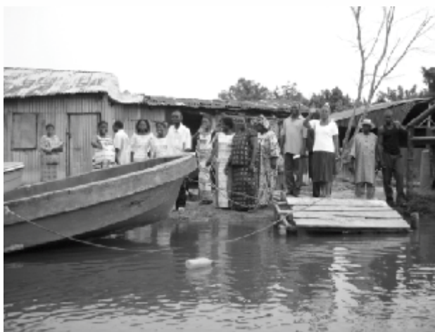
Ikpakiaba community members waving goodbye during the needs assessment visit by AAPW

risk reduction, primarily to promote more responsible corporate behaviour within the industry that has been widely criticized in the past. The strategic objective is to partner with the industry to build reputational risk towards ensuring that the doctrine of responsible environmental stewardship and socially responsible development are embedded as part of corporations' activities operating within the Niger Delta. PaS hopes to interface as a point for corporations to address some critical issues, act as a process of building trust and commitments to sustainability and partnership with communities in reducing conflicts and building lasting peace in the region.