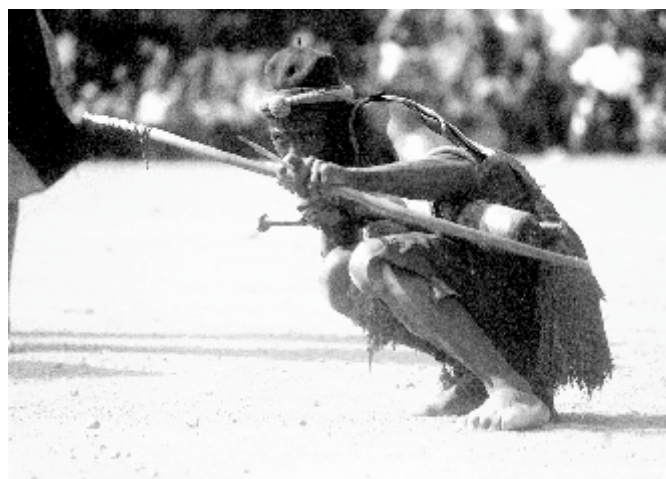
A Traditional Bowman during the 2nd Karu Unity Festival

Thus, on December 14, 2005, the transformation within the compound of the Karu local government secretariat became evident as crew/team members concerned with final touches were on ground to ensure the stage was set for action, while sound check and final check of the space was conducted. As early as 10.a.m, troupes started arriving and taking their positions in the canopies provided for them as they continued charging the festival ground with dances and music. The guest followed suite