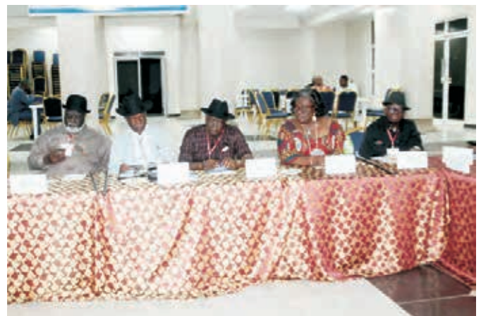
PANDEF National Leadership

He concluded by thanking PANDEF for its effort in ensuring that the region is given the attention it deserves by the federal government. He promised to always make himself available for discussions to better the fate of the Niger Delta people, saying that the essence of representation is to take the bullet meant for the people.