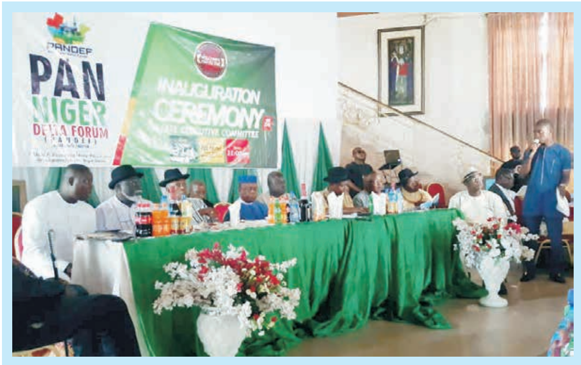
DELTA (31st October, 2019)