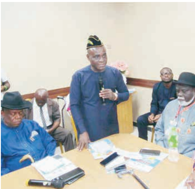
Senator Ita Enang

She advised PANDEF to be more strategic and objective in its engagement with the federal government, adding that if PANDEF is overwhelmed with the issues in the region, smaller groups can be created within its operation to handle minor issues while the parent body oversees complex issues.