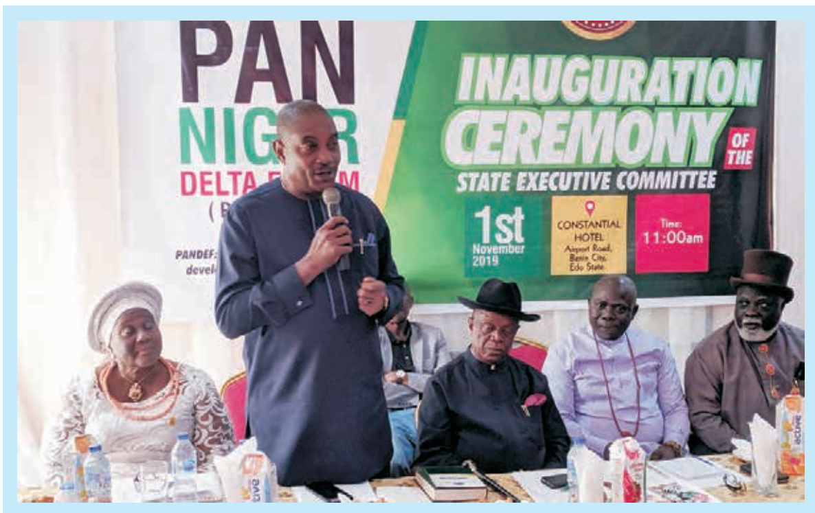
EDO (1st November, 2019)