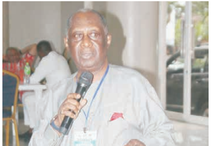
Sen. Bassey Ewa Henshaw