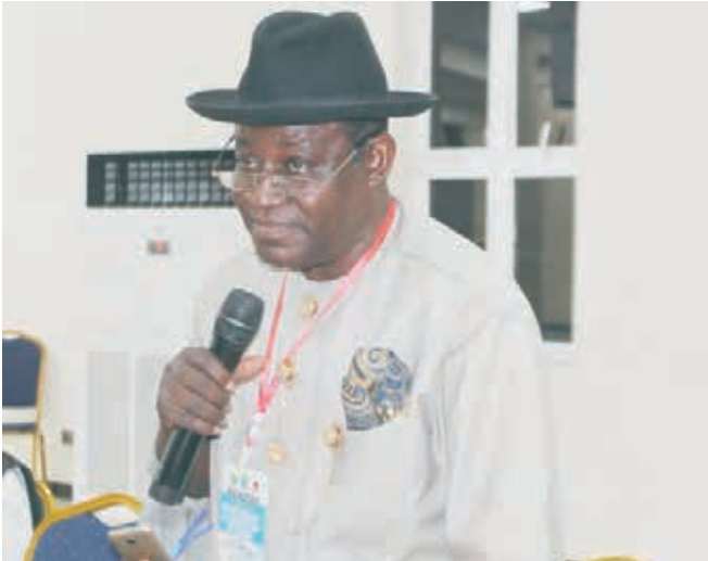
Sen. Inatimi Spiff