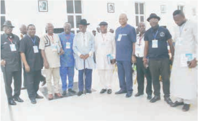
Group Photo (PANDEF)