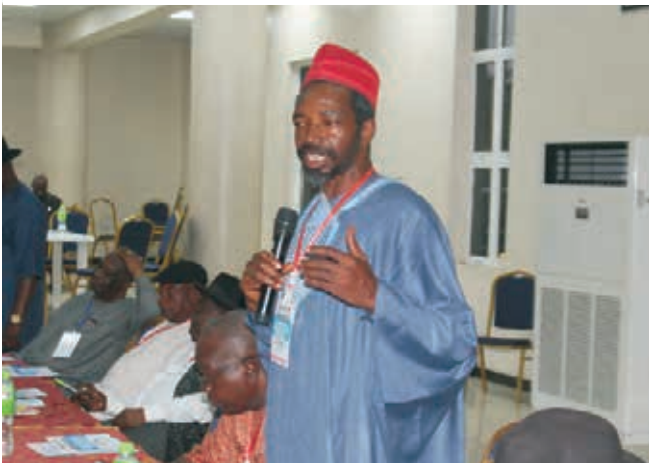
Prince Maikpobi Okaeme