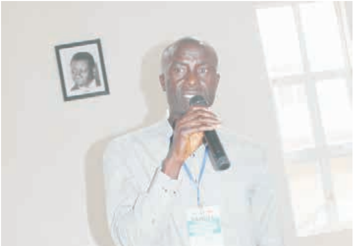
Hon. Agbiji M. Agbiji