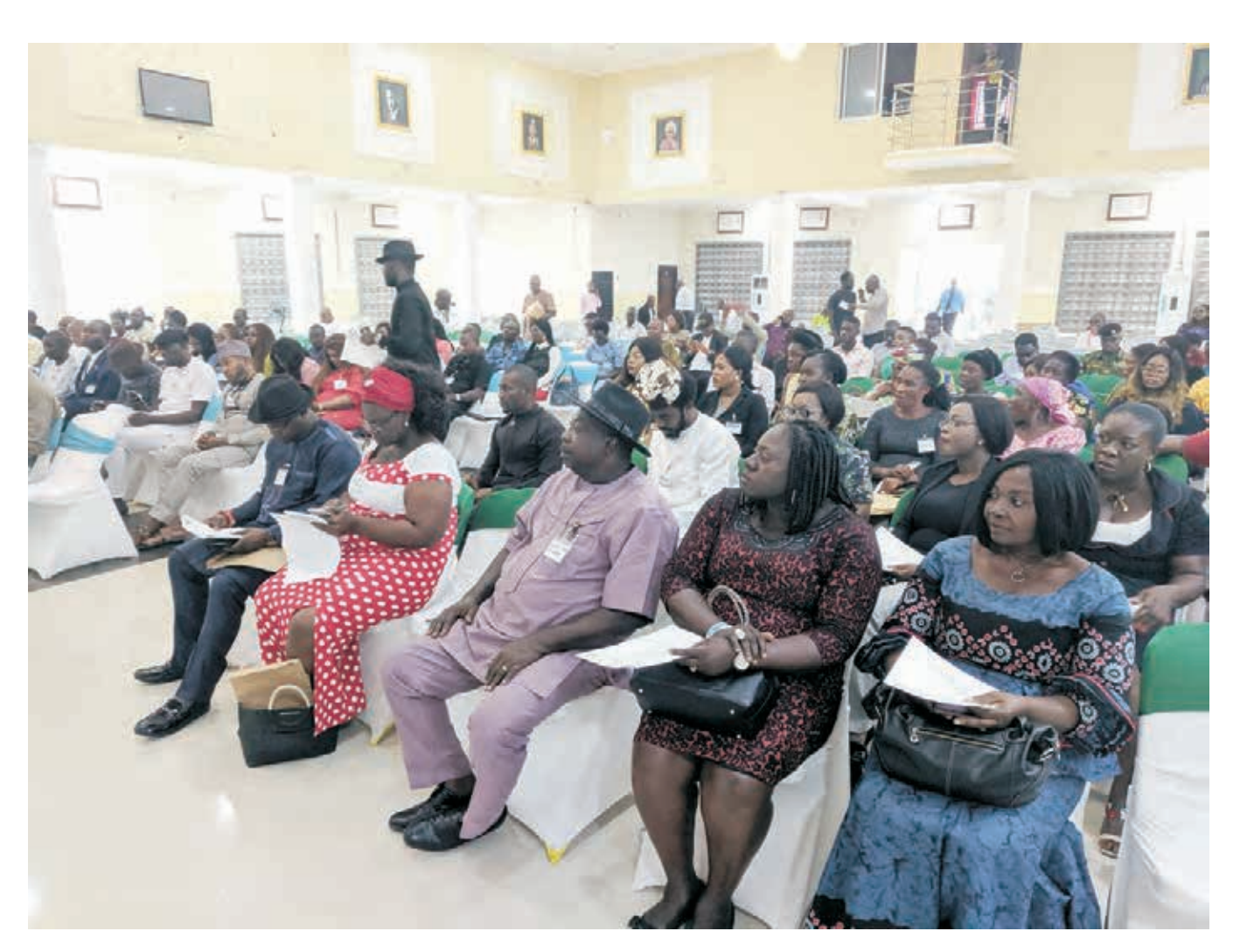
Participants listening to presentations at the 13th NDD

He advised that the success of the forthcoming election was the responsibility of everyone; hence, all hands must be on deck to make it a success.